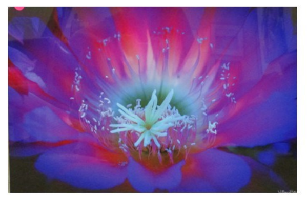
Metal Print—Cactus Flower 16 x 24 inch metal print $150