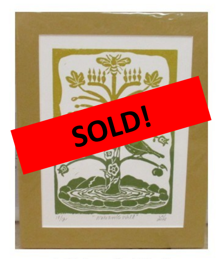
Miriam's Well 8 x 10 inch matte framed woodblock print $25