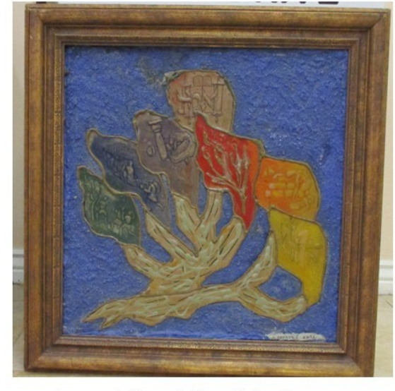
Long Island Jewish Center 26-1/4 x 27-1/4 inch framed art $250