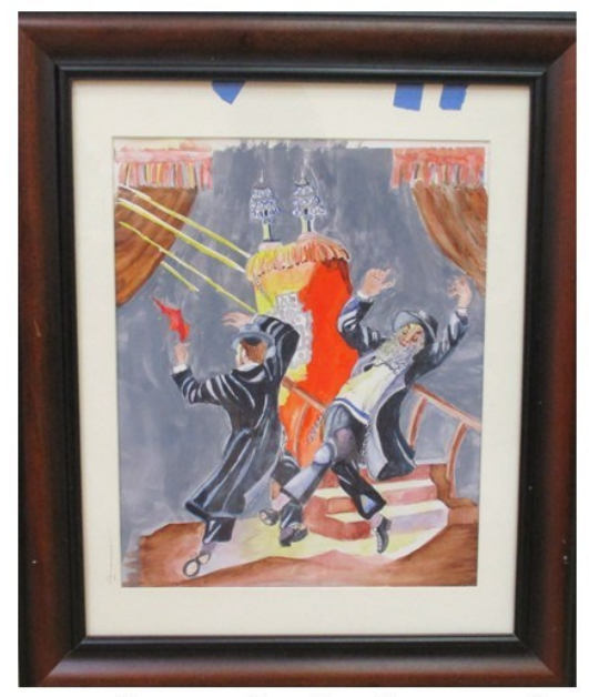
I. Rubenstein Simchat Torah 20-3/4 x 24-3/4 inch framed art $394