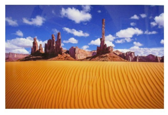
Metal Print—Desert Sands 16 x 24 inch metal print $150