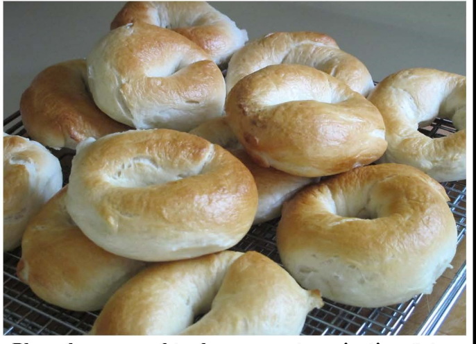
Please be prepared to show current vaccination status.

Sunday, May 1, 2022 • 10 am Michael G on piano from 9:30-10